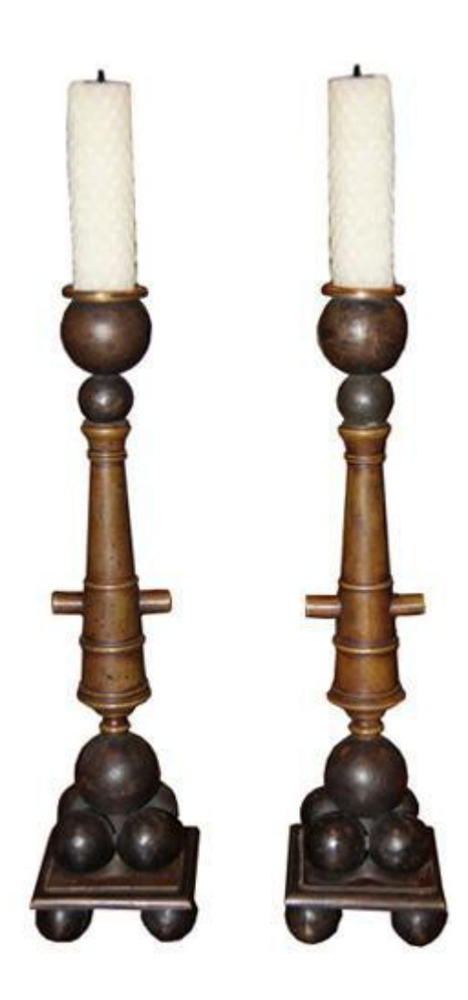
Italy 4674 M00521