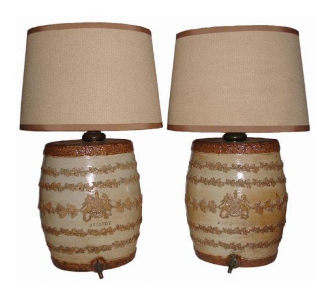
Italy 3367 M00003