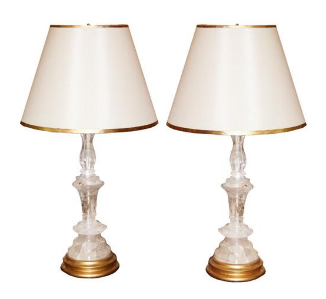
Italy 4402 M00071