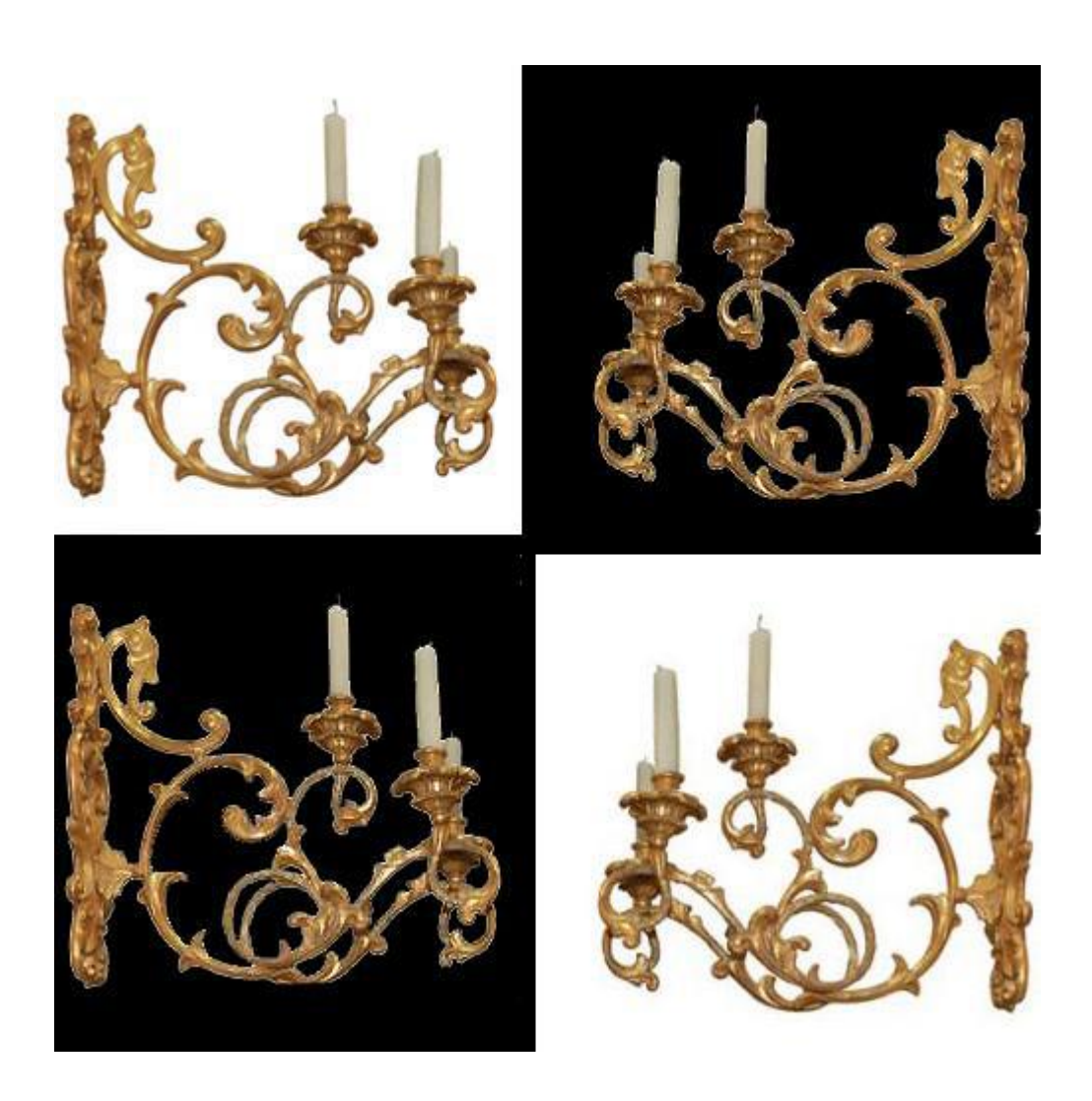
Italy 4402 M00071