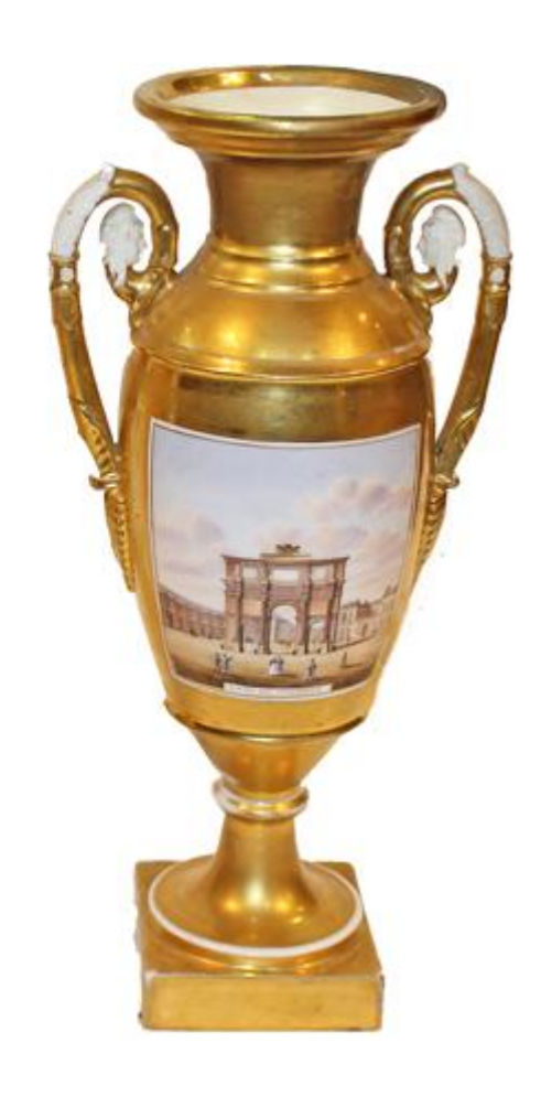
Italy 4256 M00521